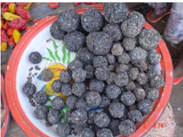
Picture 6. Parkia biglobosa fermented seeds used as spice for sauces.