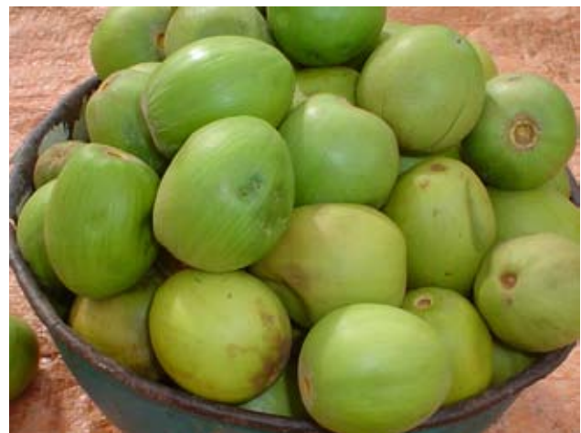
Picture 3. Fruits of Vitellaria paradoxa (shea tree).