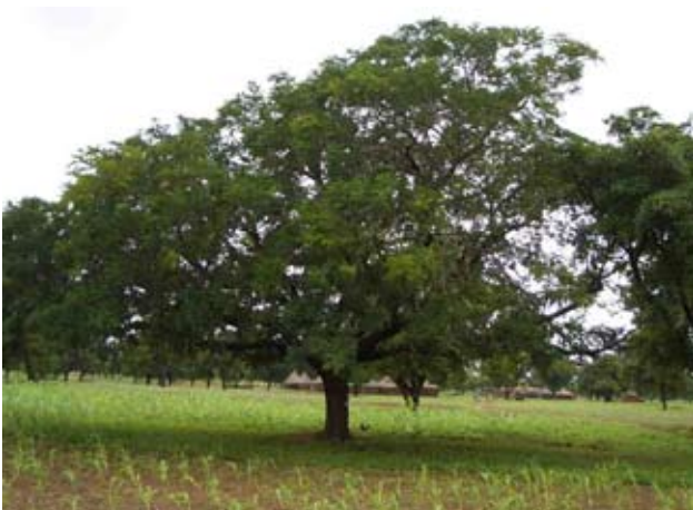
Picture 1. Parkia biglobosa (Locus bean) in a field of sorghum at Nobéré.

fires. The natural vegetation is wooded savannahs and woodlands. Agricultural landscapes are dominated by parklands woody species, such as Vitellaria paradoxa , Parkia biglobosa , Tamarindus indica , Sclerocarya birrea , Lannea microcarpa , Adansonia digitata and Faidherbia albida .