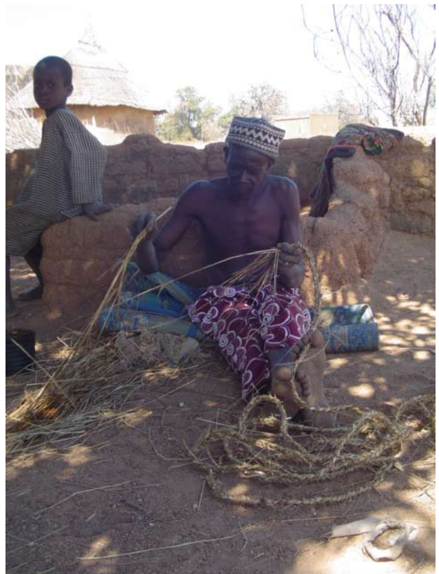
Picture 8. Farmer making rope with straw of Andropogon sp.

Edible fruit species are represented mainly by 34 species including Vitellaria paradoxa , Adansonia digitata , Tamarindus indica , Lanea microcarpa , Detarium microcarpum , Parkia biglobosa , Strychnos spinosa , Ximenia americana , Capparis sepiaria , Ziziphus mauritiana . Wild vegetables include Afzelia