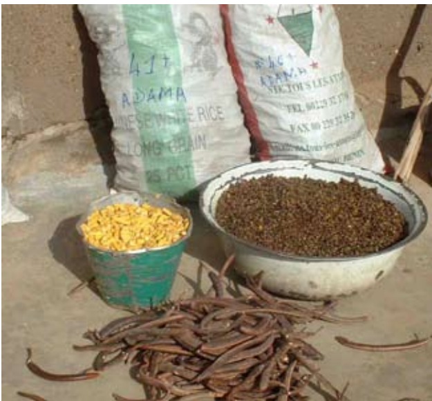
Picture 5. Edible fruits, pulp and seeds of Parkia biglobosa .