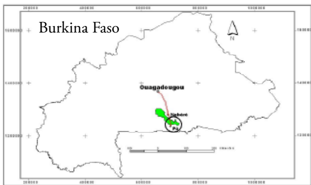
Figure 1: Study site location. The park is presented in green colour.

The study was conducted at Nobéré, located in the province of Zoundweogo (figure 1) which is part of the Centre South region of Burkina Faso, at 113 km from the capital Ouagadougou, between latitudes 11°25' and 11°45' North and longitudes 1°20' and 1°84' West.