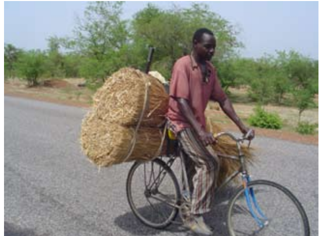
Picture 7. Farmer with straw of Andropogon sp collected in the park and transported by bicycle.