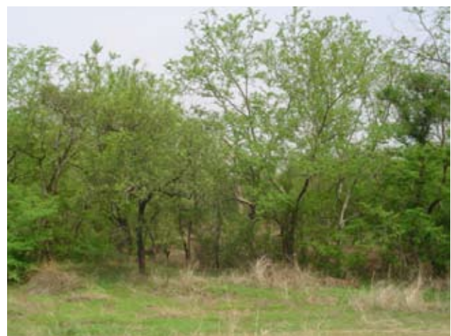
Picture 13. Good regeneration of Anogeissus leiocarpus in the park.

Inventories in the park show that some useful species recorded in the plots are scarce with low density. But plant species decline cannot only be attributed to NWFPs extraction only. The scarcity of some savannah plant species may merely reflect that these species for a long period have occurred at a low density, because of lack of suitable habitat, because of competition amongst plants, or because of fire and rambling animals (Kristensen et al., 2004). Inventories show also that young species are more abundant in our plots suggesting that regeneration takes place; this good regeneration occurs with Anogeissus lei-