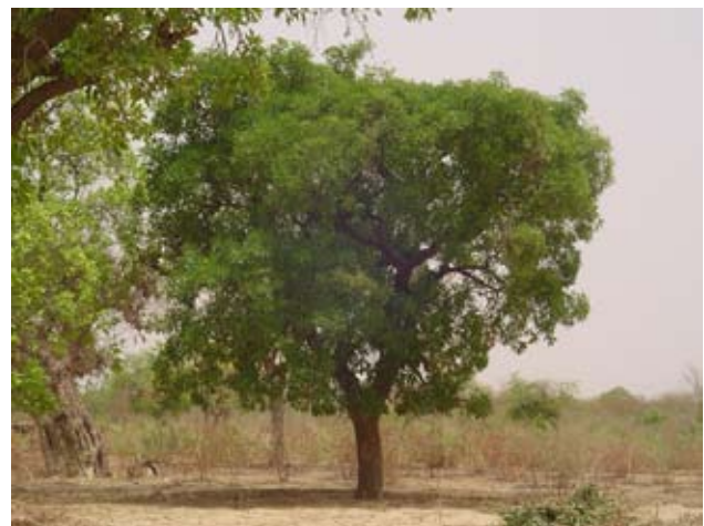
Picture 2. Vitellaria paradoxa (shea tree).

cies is mentioned include: Parkia biglobosa (114), Vitellaria paradoxa (109), Vitex doniana (108), Tamarindus indica (106), Bombax costatum (97), Paullinia pinnata (97), Sarcocephalus latifolius (97), Sclerocarya birrea (97), Saba senegalensis (95) and Adansonia digitata (94). The herbaceous species providing straw (mainly Andropogoneae ) are ranked in second position (93). In the traditional veterinary category of plant uses, investigation revealed that (93 %) of farmers use part of plant for animal health care. 39 woody species belonging to 35 genera and 22 families are recorded; these species representing 44% of the woody plant species of the Park. The most used species include Adansonia digitata , Anogeissus leiocarpus , Balanites aegyptiaca , Parkia biglobosa , Pterocarpus erinaceus , Sclerocarya birrea , Sterculia setigera and Vitex doniana . About 122 different uses for traditional veterinary purposes have been recorded.