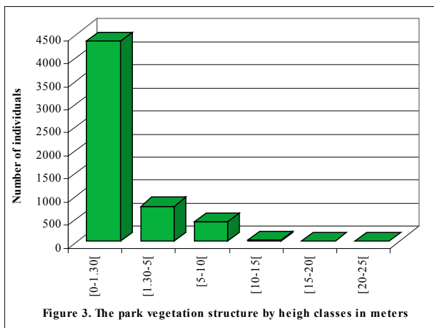
Figure 3. The park vegetation structure by height classes in meters

Individual species inventories show that the degree of regeneration varies from one species to another. Among the important species, Adansonia digitata , Saba senegalensis , Vitex doniana , Paullinia pinnata and Sarcocephalus latifolius are not recorded in the plots. Balanites aegyptiaca , Bombax costatum , Parkia biglobosa , Pterocarpus erinaceus , Sclerocarya birrea , Tamarindus indica and Sterculia setigera present a less than one individual seedling ( d < 5\text{cm} ) per hectare. Only Anogeissus leiocarpus and Vitellaria paradoxa have respectively 9 and 10 seedlings ( d < 5\text{cm} ) per ha.