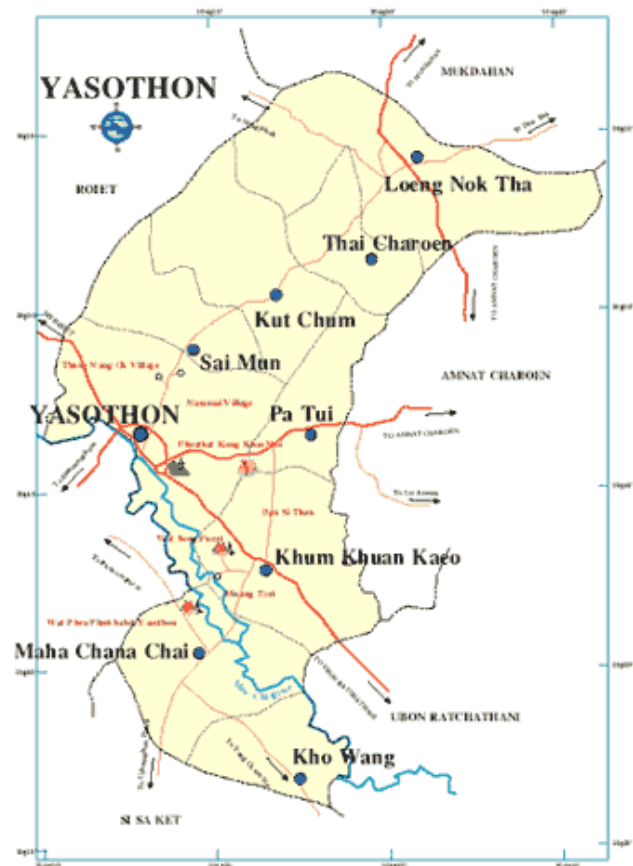
Map 1: Study Area: Kut Chum District, Yasothon Province

rounding natural areas were important as a source of dietary supplementation in the form of aquatic creatures (which were available year-round in spite of a lengthy dry season), game, fungi, wild fruits and so on. Food that was produced or collected was often shared among kin or neighbours.